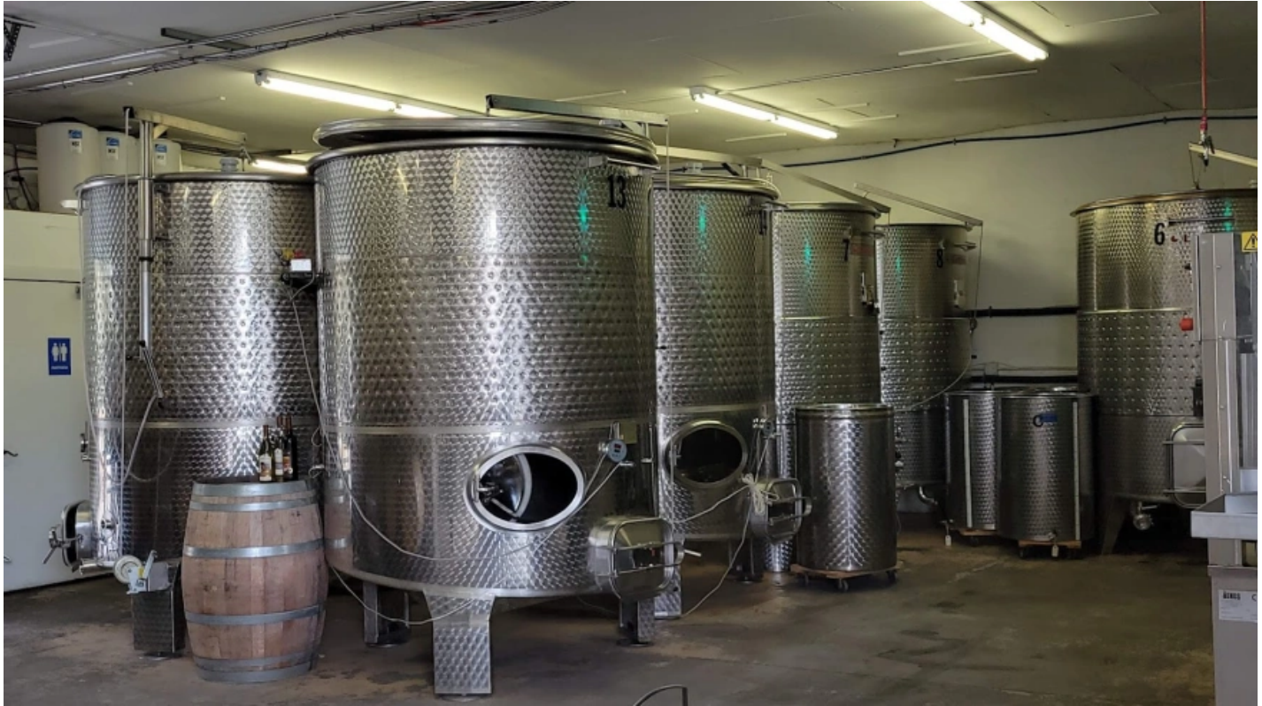
The 1,000-gallon tanks that are part of Adirondack Winery's brewing operation, which will be moved into the new building upon its completion next spring, in Queensbury, N.Y.

Since starting out business in 2008, Adirondack Winery has moved from using 5-gallon glass jugs for brewing to a set of 1,000-gallon metal tanks, sitting in the building currently used for brewing. Outside, there are 2,000-gallon tanks that can't fit in the existing building.